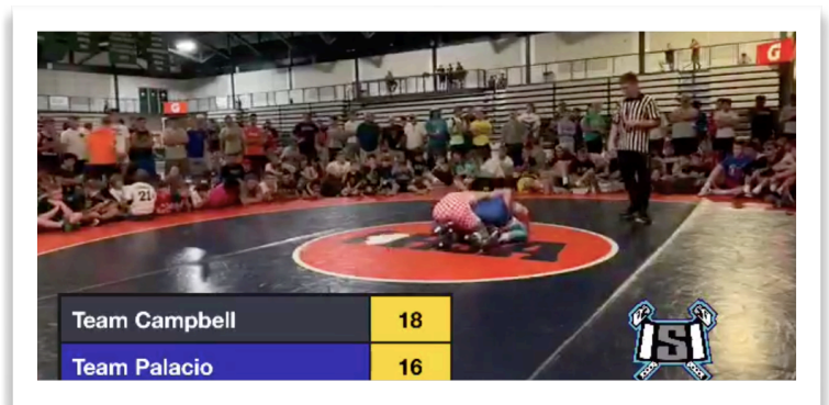
Live broadcasted All Star Dual