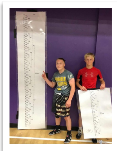
Takedown Tournament Bracket

This packet is filled with pertinent information about our camps.